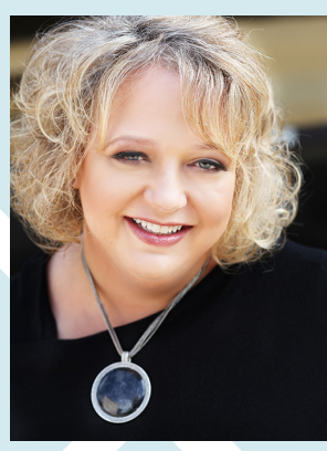
Stapleton VP - Workforce & Education