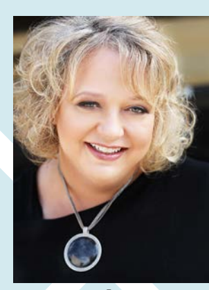
Stapleton VP - Workforce & Education