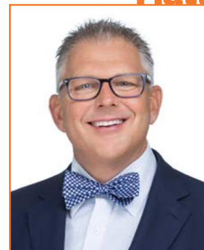
CEO, Greater Topeka Partnership