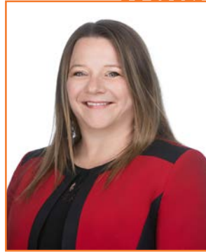
Director, Business & Talent Initiatives