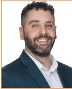
Director of Equity & Business Development