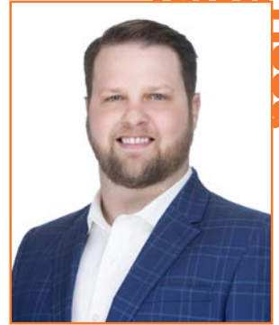
Executive Director of Forge Young Talent