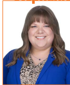
Director of Entrepreneurship & Small Business