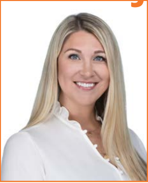
Director of Business Development