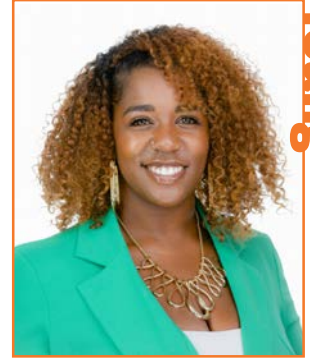
Marketing Project Manager