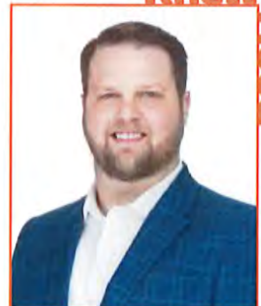
Executive Director of Forge Young Talent