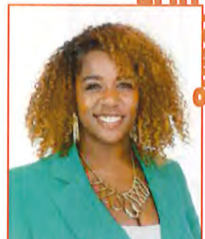
Marketing Project Manager