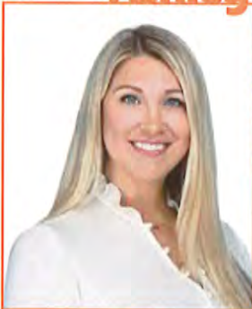
Director of Business Development