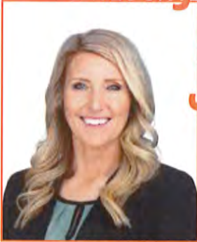
President, GO Topeka