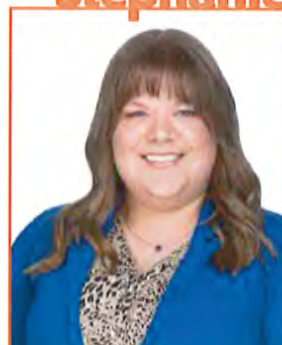
Director of Entrepreneurship & Small Business