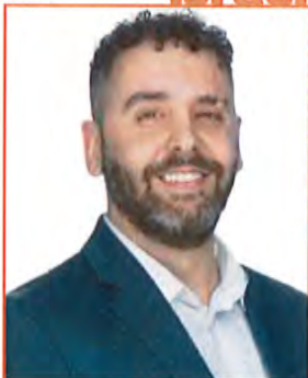
Director of Equity & Business Development