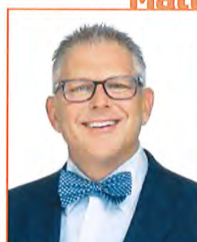
CEO, Greater Topeka Partnership