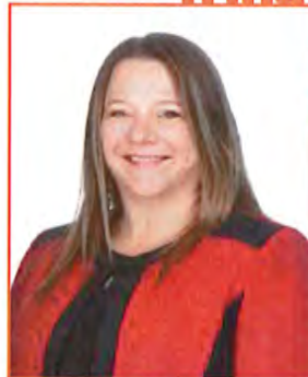
Director, Business & Talent Initiatives