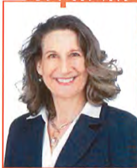
SVP of Innovation